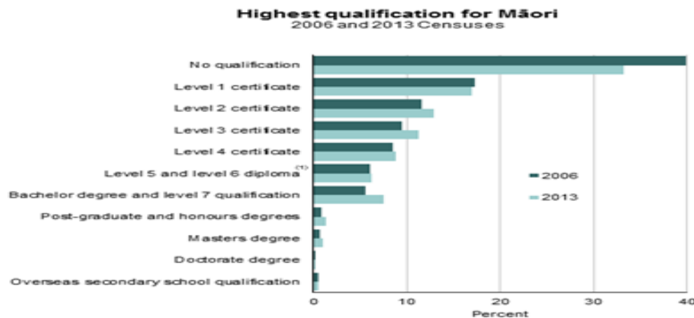
Figure 1: Qualification Attainment by Maori in 2006 & 2013