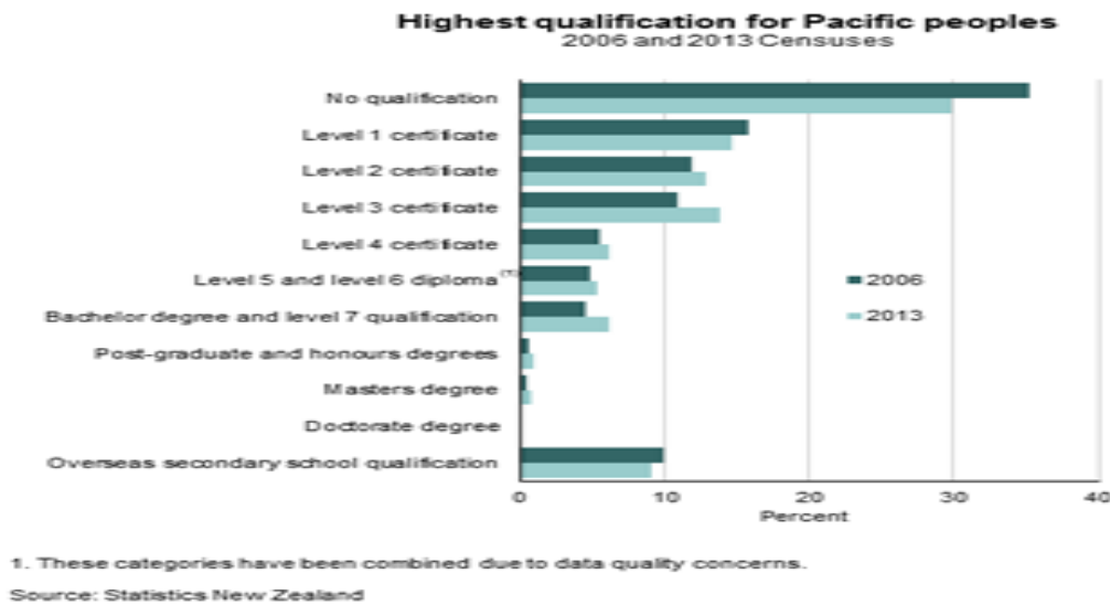
Figure 2: Qualification Attainment by Pasifika in 2006 & 2013

Figure 2 shows highest qualification attainment by Pacific people in New Zealand in 2006 and 2013. It should be noted that less than 15 % of Pacific people had a qualification at level 5 and over, noting that no Pacific student had a doctorate degree in both 2006 and 2013 census records by Statistics New Zealand.